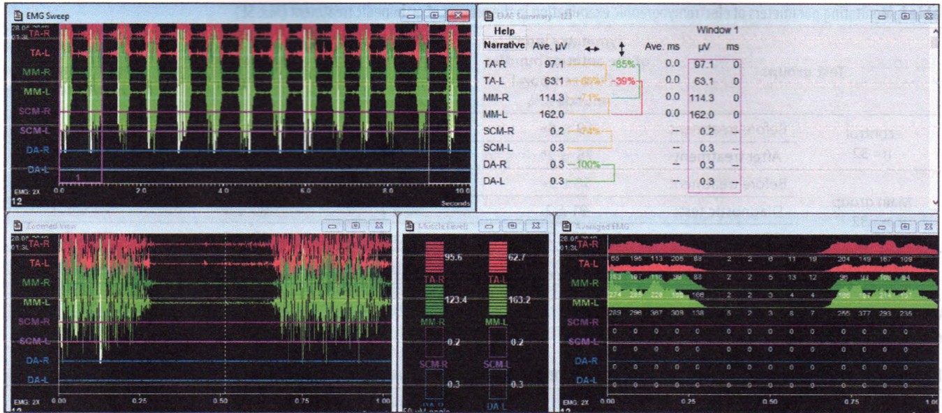
Fig. 1. 30 years-old patient M's myography (the main group, before treatment)