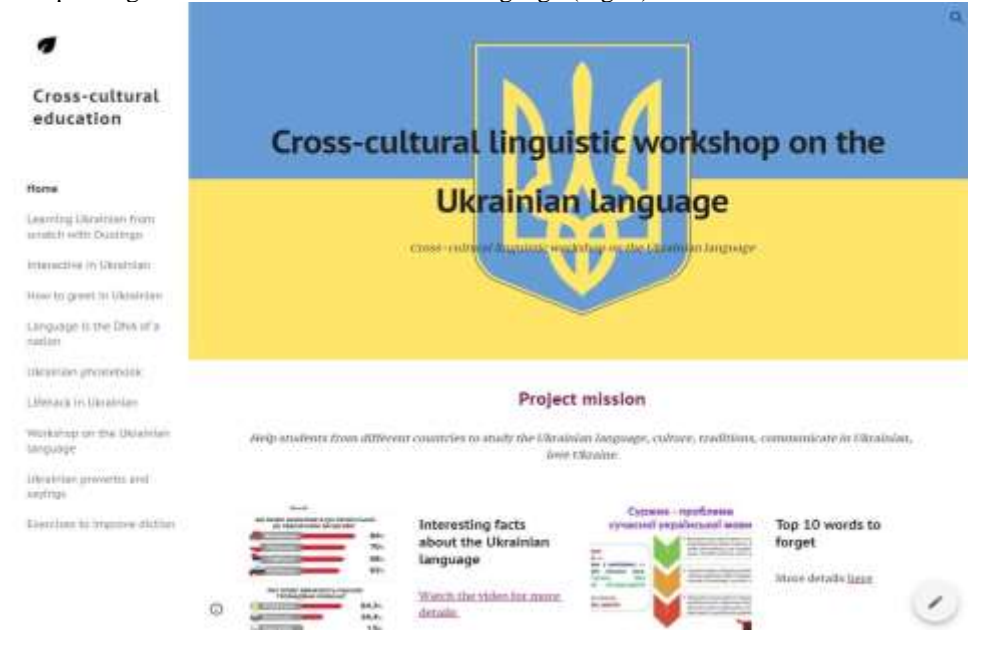
Fig.1: The main page of the interactive educational resource «Cross-cultural linguistic workshop on the Ukrainian language»

2) An interactive educational resource «Cross-cultural linguistic workshop on the Ukrainian language» has been developed to help foreign students learn the Ukrainian language (Fig. 1).