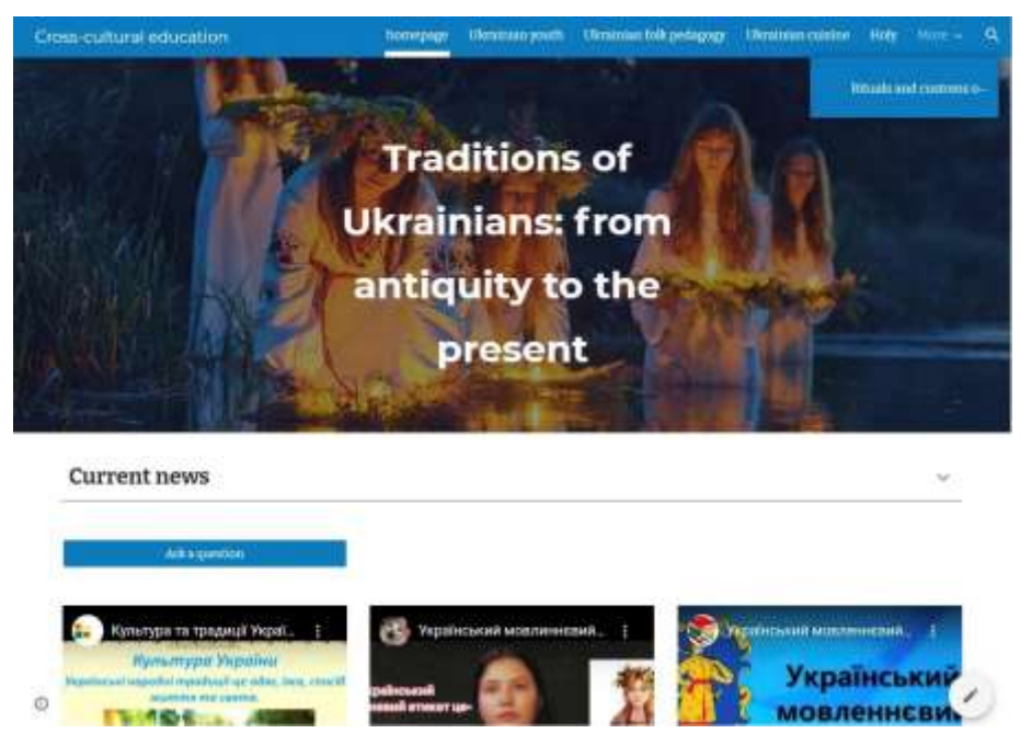
Fig.2: The main page of the interactive educational resource «Traditions of Ukrainians: from ancient times to the present»

3) Analyzing the structure of interactive educational resources, we conclude that their didactic tools cover all the necessary components to improve the quality of education of foreign students and the organization of their independent work in mastering the basics of the Ukrainian language in close connection with culture and traditions, system of cross-cultural knowledge: theoretical material, multimedia support of theoretical material, practical exercises, various forms of knowledge control, library, visualization of knowledge, organization of effective feedback with students, etc.