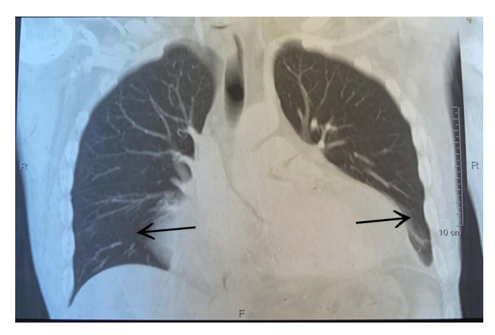
Figure 5. An enlarged fragment of the MS CT film of the chest organs of patient P., 42 years old, dated 07/16/2020, which clearly shows how the identified cystic formations created moderate compression of the adjacent parts of both lungs (shown by arrows).

Repeated echocardiography on 07/20/20 confirmed our assumptions, as two large volumetric formations surrounded by capsules and filled, probably with a gel-like mass, were also found in the projection of the pericardium. Visually, they were similar to cysts of the mediastinum or pericardium, which greatly compressed the heart, creating a risk of its tamponade (Figure 6).