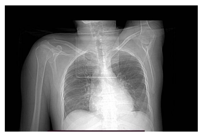
Figure 1. CT of the thoracic organs. Patient P., 42 years old (description in the text).

The results of the study indicated the negative dynamics of changes: the hydrothorax spread to both lungs (more on the left), in addition, signs of basal pneumofibrosis were detected, which could be the cause of the progression of shortness of breath. Signs of hydropericardium persisted. These data indicated both the ineffectiveness of the prescribed therapy and the progression of cardiac pathology and pathology of the bronchopulmonary system.