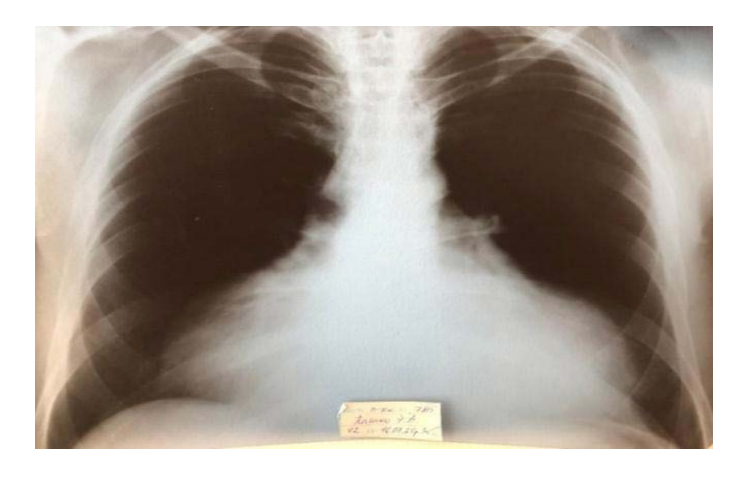
Figure 3. An X-ray of the chest organs of patient P., 42 years old, dated 07/16/2020, indicates an expansion of the silhouette of the heart against the background of the absence of pathology from the side of the lungs.

During examination (July 16, 2020): Hb: decrease in Hb level to 114 g/l, acceleration of ESR to 34 mm/h. Other indicators and results of biochemical blood analysis, coagulogram and urine analysis were without pathological changes; ECG: heart rate 120/min. The rhythm was sinus. Horizontal position of the electrical axis of the heart. LV hypertrophy with changes in the myocardium; ECHO CS – ultrasound signs of dilatation of the left atrium, reduced contractility of the left ventricle, exudative pericarditis with the threat of cardiac tamponade; X-ray of chest organs in direct projection showed that lung fields were transparent, the sinuses were free, and the roots of the lungs were covered by an extended median shadow. It was visualized as a pear-shaped homogeneous formation with relatively even upper-external contours (Figure 3).