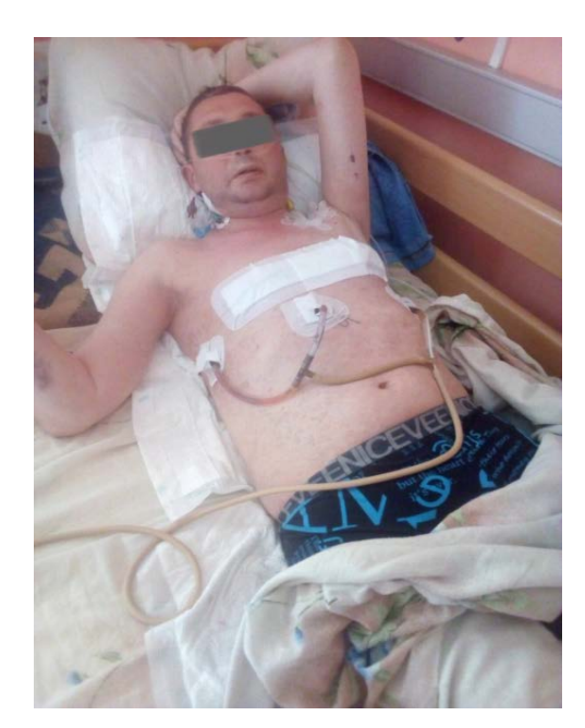
Figure 8. Photo of patient P., 42 years old, on the 4th day after surgical treatment.

After surgical treatment and symptomatic therapy, the patient's condition improved significantly, the severity of shortness of breath decreased, and what seemed incredible – skin rashes disappeared without specific treatment (Figure 8).