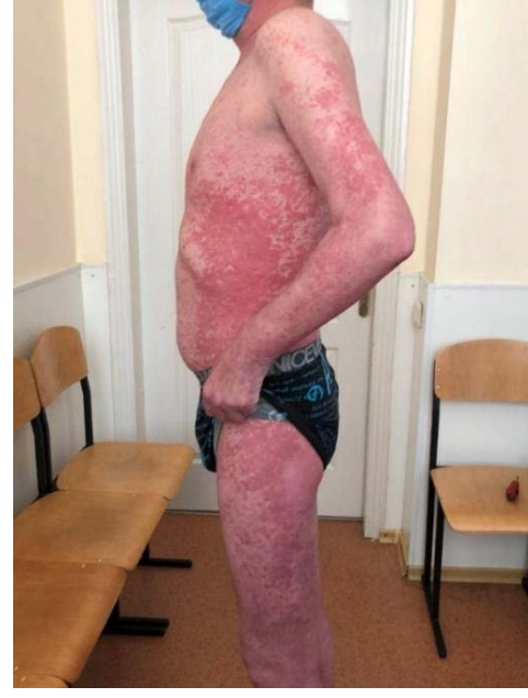
Figure 2. Erythematous psoriatic rash on the body of patient P., 42 years old.

From the history of life: since 1998, he suffered from psoriatic disease, in 2014 he was diagnosed with hypertension, degree 2, stage II, moderate risk.