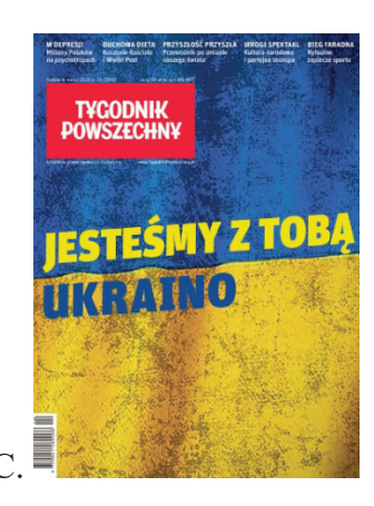
Figure 1. Covers made in colors of the Ukrainian flag

There is no doubt that there are many more samples of covers on which the yellow-blue color scheme prevails. From our view, they are united by a single key idea – support for Ukraine, a demonstration of solidarity and admiration for Ukrainian resilience and the army's ability to resist the enemy.