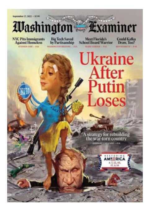
Figure 3. Cover "Ukraine after Putin loses"

Ukraine is a unique and independent country at the same time. It has a machine gun behind her back, and 2 medals with NATO and EU inscriptions on her neck. The idea of joining NATO and the European Union was supplemented with a verbal component, particularly the phrase "Ukraine after Putin loses". This magazine cover is supported by an article about the strategy for the recovery of Ukraine after the victory over the Russian fascists. The core idea is embodied in the colors of this multimodal sample. The traditional grey color of hopelessness and devastating fear has been changed to interspersed with the colors of the Ukrainian national flag. Yellow and blue tones that color the horizon portend victory and prospects for the development of Ukraine after the Russian defeat.