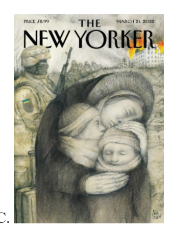
Figure 2. Covers made in a crimson-gray color paradigm