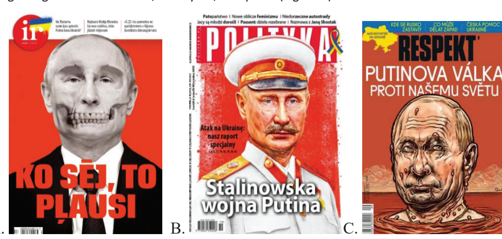
Figure 3. Covers made in a red color paradigm

Let us look at several samples of multimodal texts that became the basis for the covers of foreign magazines such as "IR", "Polityca", "Respekt" (Figure 3).