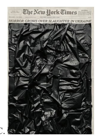
Figure 4. Covers with a black background