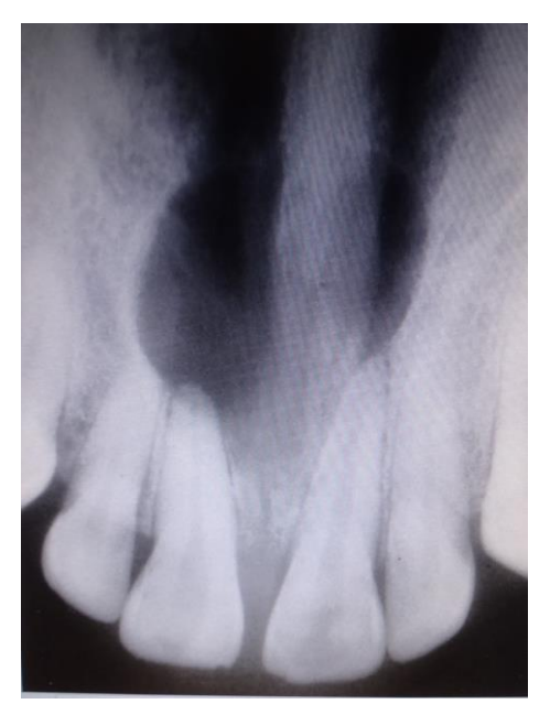
Figure 2. The lamina dura is not seen around the anterior teeth, and apex resorption of the lateral tooth root of the right incisor is evident. (White arrow).

A clinical diagnosis of a nasopalatine duct cyst was made. Therefore, surgical excision of the lesion was proposed to the patient. The surgical intervention was carried out under local anesthesia by infraorbital block injection and infiltration with 4% Arctician containing 1:100,000 epinephrine. Crevicular incision is given and the palatal flap elevated (Figure 4).