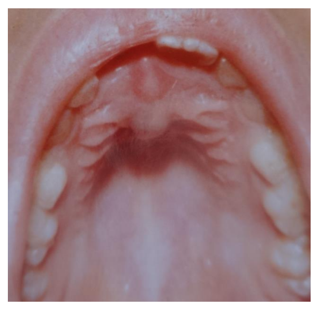
Figure 1. A swelling, almost 1cm in diameter in the nasopalatal region between the maxillary right and left central incisors.

Extraorally there was no detectable abnormality or lymphadenopathy. Intraoral examination revealed a well-defined oval shaped bluish swelling measuring approximately 12×15 mm, located posterior to the palatine papilla in the midline. The swelling was fluctuant and non-tender (Figure 1).