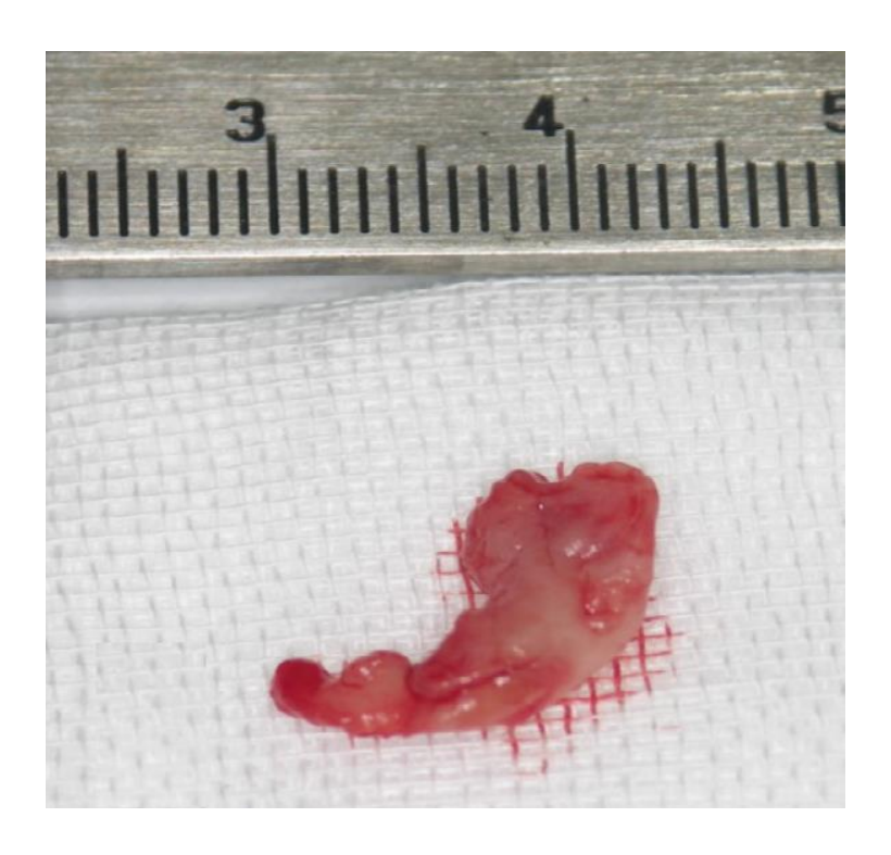
Figure 5. The surgical specimen demonstrates that the nasopalatine neurovascular bundle is continuous with the lesion.

In a microscopic examination, cyst epithelium can be seen from stratified, squamous to simple cubic. In the lower connective wall the average Infiltrates of the chronic inflammatory cells of lymphocyte, plasma cell, and histiocyte and some acute neutrophilic inflammatory cells as well as nervous bundle sections, arteriole and vein are visible. The final diagnosis was a nasopalatine duct cyst (Figure 6).