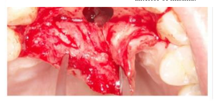
Figure 4. A crevicular incision is placed and a palatal flap is raised. The cystic lining and contents are removed and the lesion is completely enucleated.

The lining of the cyst was removed and the specimen was subjected for histopathological examination (Figure 5).