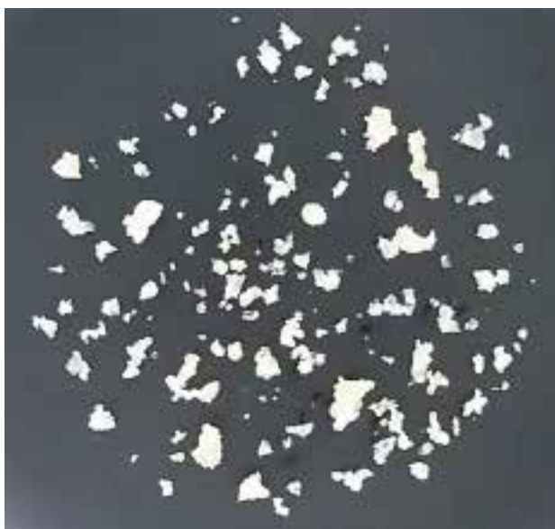
FIGURE 1. Digital image of masticatory pattern fragments

The mean value of fractal dimension index for the second research group made up 1.50 (St.Err. = 0.001) and being combined with median value of 1.49 and statistical distribution symmetry corresponded to the common parametric distribution laws within population. In this case the mean fractal dimension values in the bottom and top quartiles of the given sample were fixed at the level of 1.47 and 1.51 respectively (Fig. 2B).